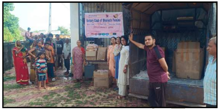
Relief Work - Food Packets and clothes distribution at Chhapra and Juna Chhapra Village