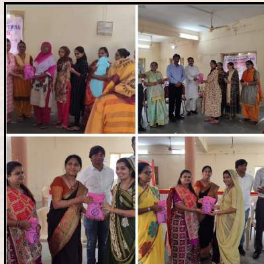
Protein Kits Distribution to 55 Pregnant Women in Chavaj Village in August 2023