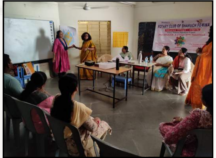
Teacher's Training for Primary & High School teachers on Topic 'Joyful Learning'