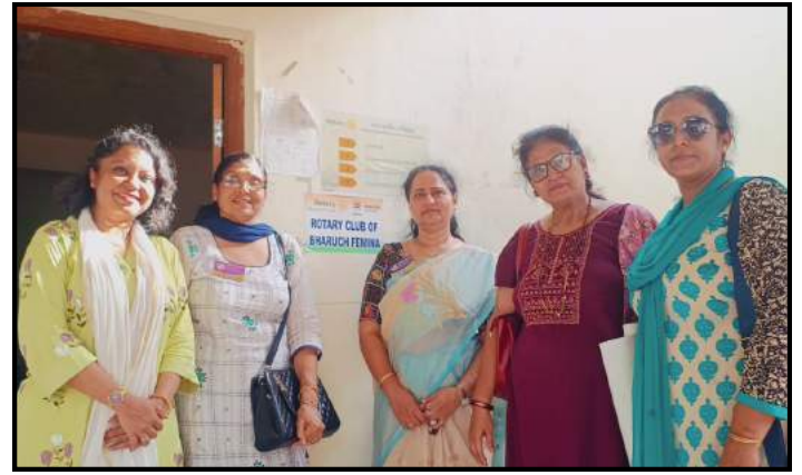
Propagation of Rotary Four Way Test by raising awareness and distributing flyers in various places in Bharuch