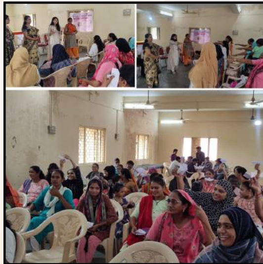
Garbh-Sanskar Seminar for Pregnant Women in Chavaj Village in August 2023