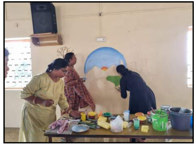
Beautifying walls of Sadhana School with Wall Painting/Messages on Environment & Swatchhata