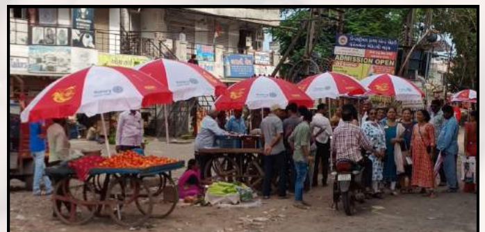
'Rotary No Chayo' - Distribution of Umbrellas in local vendors