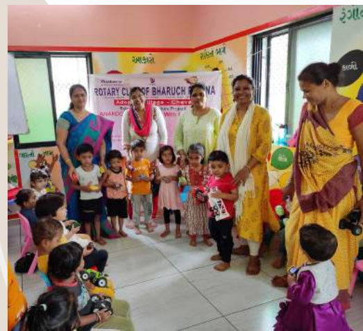
Distribution of Toys and snacks in 2 Anganvadis in Chavaj Village