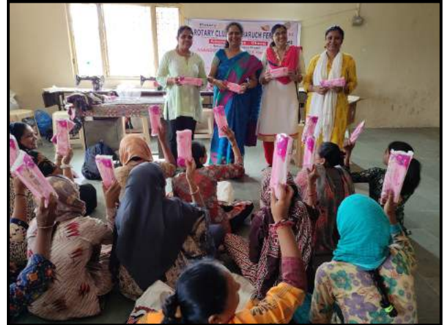
Sanitary Pad Distribution at Chavaj Village and Chhapra Village