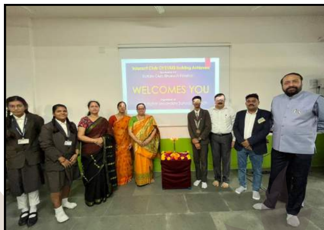
To mark the 77th Independence day, the Interact Club of SVMS BUDDING ACHIEVERS participated in the national campaign 'Meri Mati Mera Desh' A 'Panch Pran' pledge was taken by the Interact students alongwith their teachers demonstrating their commitment to our great Nation