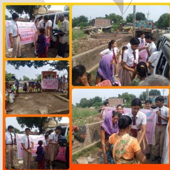
Commendable Relief work done by Interact Club Members of Calorx School by Donating Food Grain & Clothes in Shuklatirth & Kadod Villages