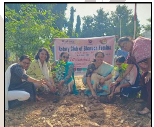
Tree Plantation Drive at Brahma Kumaris, Chavaj Village