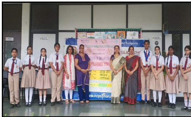
Elected Members of Interact Club of Narmada Calorx (NCPS Buddies) school took oath under Sponsorship of Rotary Club of Bharuch Femina in August 2023.