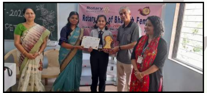
Inter School Drawing, Poster Public Speaking Competition on Patriotism and Environment in Sanskar Vidya Bhavan