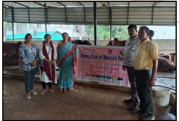
Medical Checkup of Cows and their Inoculation at Gaushala in Brahma Kumaris Ashram