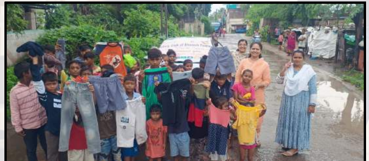
Relief Work - Lunch Packets and clothes distribution at Maktampur