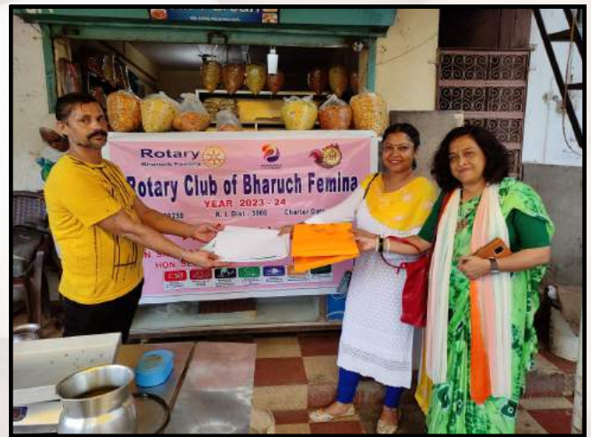
Environment Friendly bag distribution in local vendors and knowledge shared on the benefits of reducing plastic dependency on Independence Day