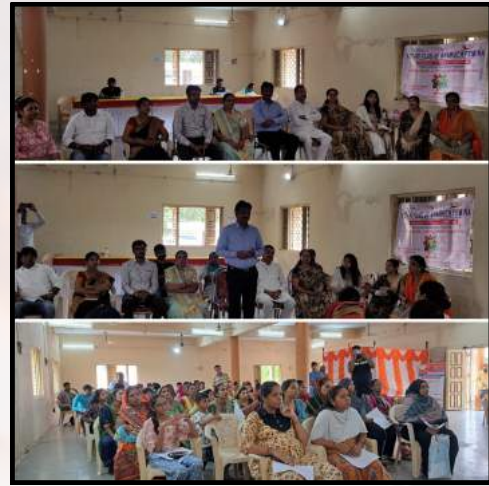
Free Medical Check-Up Camp for Expecting Mothers in collaboration with Chavaj Gram Panchayat and 7X Multispeciality Hospital in August 2023