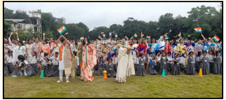
Independence Day Celebration in Sanskar Vidya Bhavan with hoisting of the Indian Tri-colour and flag march filling every heart with pride and patriotic fervour