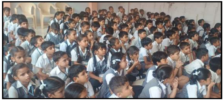
Good Touch, Bad Touch Training for students at Sanskar Vidya Bhavan School